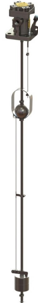
FS22 WITH LOWER CHECK