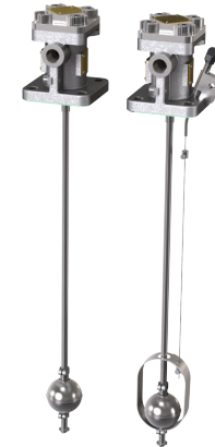
FS21 AND FS22

The checkable features are available as an option, making functionality testing quick and easy.