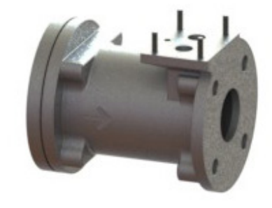
2" - SV2035 Aluminium