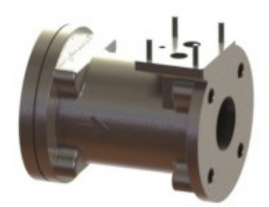
2" - SV2043 St/St