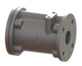
l ½" - SVl507 Aluminium