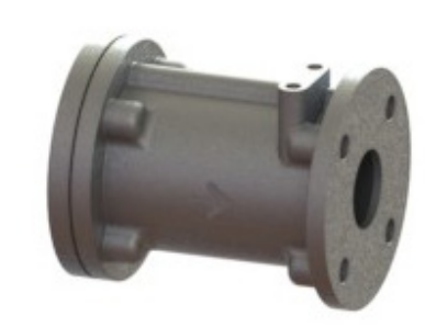
2" - SV2023 Aluminium