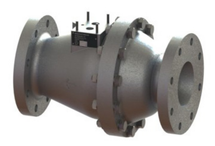
4" - SV4000 Aluminium