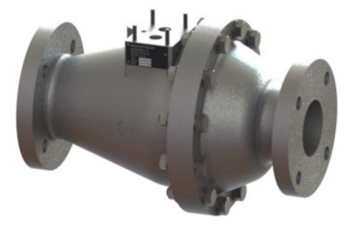
3" - SV4636 Aluminium