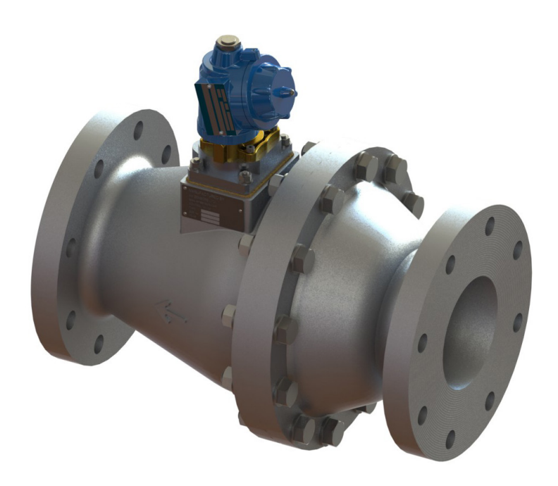
TANK FILLING CONTROL VALVE

Designed for installation into a pipeline system, 1.5", 2", 3" and 4" variants are available with a range of inlet and outlet flange connections.